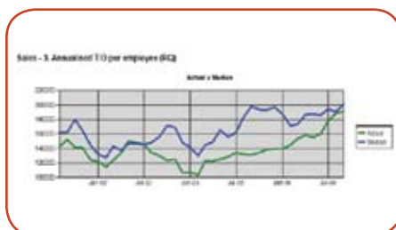
A typical analysis chart